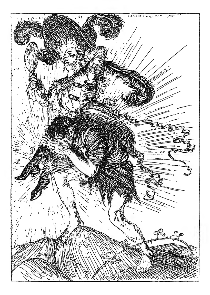
"She outshines the peacock's excess above his mate." To\ face\ page\ 202.